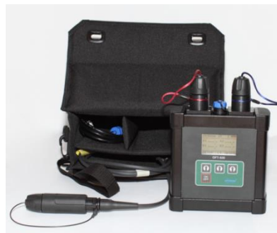
Complete test set, including: OFT-920 tester, power charging adaptor, soft carrying case, USB Cable, reference patchcord 4

Note: 4) reference patchcord – would be ordered according to STR_03-10_EN-HMA_Master