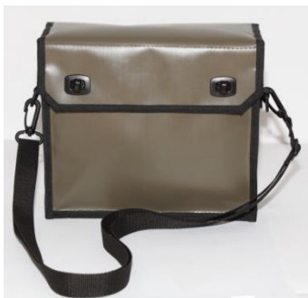
Soft carrying case